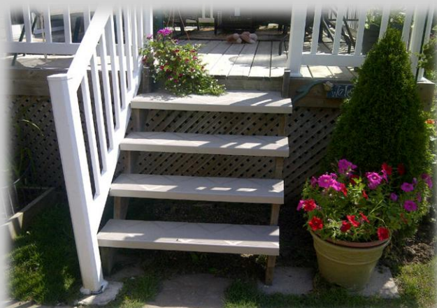
"The Safest Step You'll Ever Take"